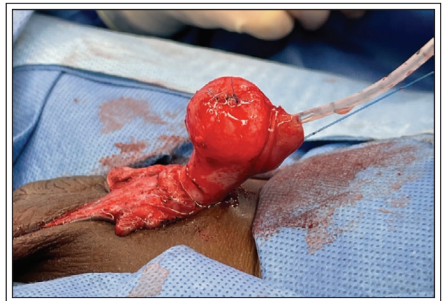
Figure 2. Intraoperative circumferential incision with dissection of foreskin and filling of megalourethra.

After the extent of the megalourethra was demarcated, it was incised in the midline. This revealed redundant urethral mucosa with a very thick outer rind. The urethra was adequately mobilized from this outer tissue before excess urethral tissue was excised. A urethroplasty was then performed in a running subcuticular fashion using 7-0 PDS suture. Tubularization was performed with an 8fr catheter in place. After completion, an angiocatheter was inserted adjacent to the catheter, and saline was passed to confirm a watertight closure. The de-mucosalized outer tissue was then used for second layer coverage in a vested fashion – that on the patient's right side was folded over the urethroplasty and secured using interrupted 6-0 PDS sutures, and then that on the patient's left side was similarly folded over and secured. To correct skin placement on the penis, a simple scrotoplasty was performed. The remainder of the circumcision was closed with interrupted stitches. The incision was covered with Dermabond and Coban was placed around the penis. A double diaper was then placed for catheter drainage.