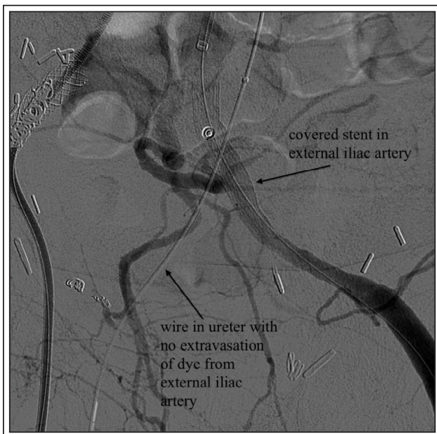
Figure 2. Iliac arteriogram after deployment of an external iliac artery stent. With subsequent takedown of the ureteral balloon, no contrast is seen in the ureter.

It is crucial that both the urology team as well as the vascular team be available and work together. The less desirable alternative, especially in the case of external