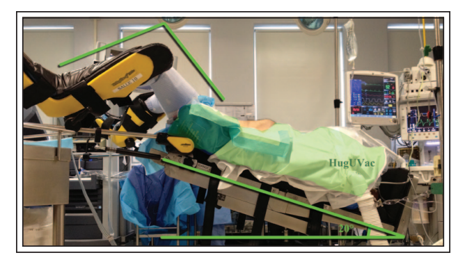
Figure 1. Patient positioning for robot assisted radical prostatectomy. The patient is placed on steep (20 degrees) Trendenlenburg position and then secured with the Allen's Hug-u-Vac steep trend positioner (Allen Medical Systems, Acton, MA, USA (http://www.allenmedical.com/uploads/files/pdf/D-770599_A1_Allen_Hug-u-Vac_Steep_Trend_Slicksheet_NP.pdf)

Only after this preparation has been completed, is the patient put in Trendelenburg position at an inclination of 20-25 degrees to facilitate exposure of the pelvic content. Studies have shown that patients undergoing this procedure in a steep Trendenlenburg position for 3h-4h do not present significant cerebrovascular, respiratory or hemodynamic problems. However, caution is advised for longer operative time, in particular for patients with glaucoma, as prolonged trendelenburg position can increase intra-ocular pressure.