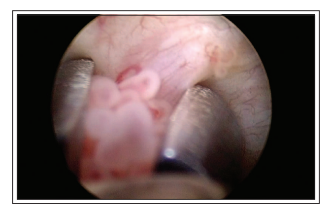
Figure 2. Initial biopsy.

cystourethroscopy is still required to ensure that concomitant tumors are not missed as well as to identify the ureteral orifices and assess the bladder outlet, Figure 1.