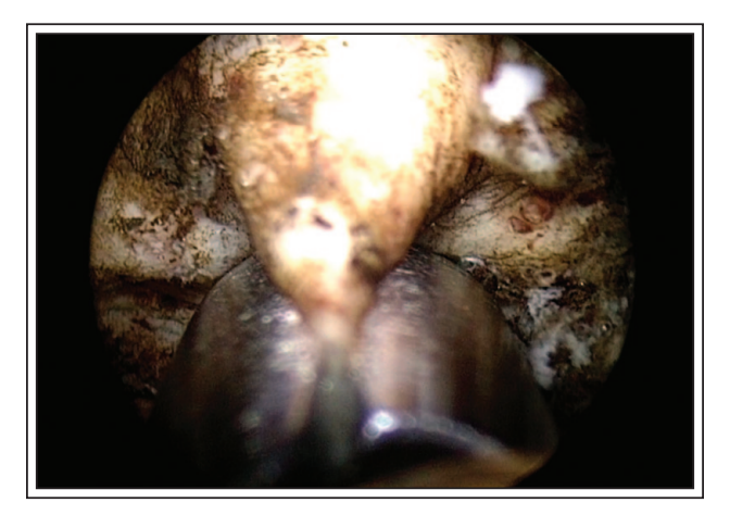
Figure 5. Final biopsy of base of tumor.

6) Tumor vaporization then proceeds, Figure 3. It is very important to remember that the Olympus Button Electrode can just as easily vaporize normal bladder mucosa as the tumor. The surgeon has to be diligent to avoid vaporizing a hole through adjacent normal urothelium. Also, the bipolar generator will only allow the surgeon to continuously apply current for 30 seconds. Thus, it is important to remember to intermittently stop applying current or the bipolar generator will automatically stop. Vaporization continues until the tumor base is reached, Figure 4. At this point, the operating surgeon can either take deep biopsies (usually three to four) of the tumor bed using the rigid biopsy forceps or switch to the bipolar loop electrocautery to resect the tumor bed, ensuring inclusion of muscle in the specimen, Figure 5. Our initial experience has shown that either method is adequate, however we have found that with certain tumor locations, specifically lateral wall, it has been difficult to obtain a good biopsy specimen