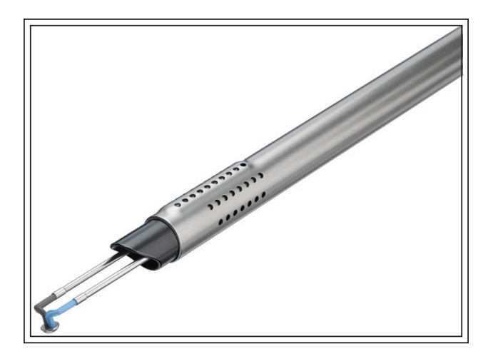
Figure 2. PlasmaButton.

Once all chips have been removed from the bladder, the bipolar loop is then removed and the PlasmaButton, Figure 2, is then engaged into the working element of the scope and further vaporization of the prostate is then carried out over the resection sites. The advantage of the vaporization is two-fold. First, it allows for smoothing of the resection bed through vaporization and then aids in better hemostasis than the bipolar loop. The resectoscope set up remains the same, only requiring switching the electrode from the loop to the button, which provides simple and convenient versatility to the procedure. Once an appropriate amount of prostate tissue has been resected and subsequently vaporized, the PlasmaButton is then used to isolate and cauterize any obvious arterial source of bleeding. Once arterial bleeding has been addressed, the entire resection bed is then cauterized in circumferential manner, starting at the bladder neck proceeding distally to the resected edge near the verumontanum. A visible blanching of the prostatic tissue is seen. At this time, all inflow and drainage is turned off to ensure hemostasis has been achieved. If no further cauterization with the PlasmaButton is required, the scope is then removed and a 22 French three-way catheter is then inserted into the bladder and continuous bladder irrigation is initiated on a slow to moderate drip.