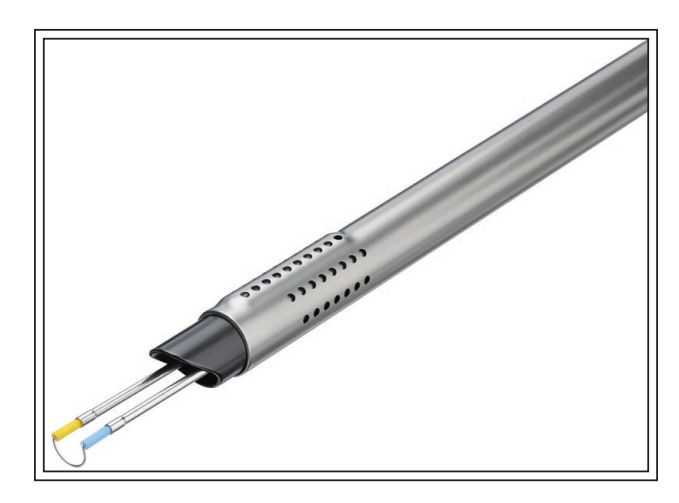
Figure 1. Olympus' PlasmaLoop with bipolar energy.