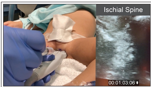
Figure 1. Ultrasound guided pudendal nerve block technique. Prior to injection of local anesthetic, there is adequate visualization of the ischial spine (hyperechoic semicircle with an inferior hypoechoic bone shadow).