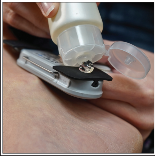
Figure 2. First steps for assembly and positioning of the device.