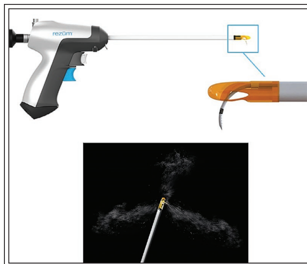
Figure 2. The Rezūm Delivery Device and Vapor Needle. The vapor needle resides within the insulated lumen of the delivery device until it is deployed into the prostate tissue. The hand-held control delivers water vapor providing a consistent energy dose into the prostate tissue through the retractable 18-gauge rigid plastic needle; saline flush irrigation enhances visualization and cools the urethral surface. The needle is flexible braided silicone tubing with 12 small emitter holes spaced around its tip at 120° intervals to allow a controlled, uniform circumferential dispersion of water vapor into the prostate tissue to create an approximate 1.5 cm-2 cm lesion. The insert shows the shaft with the needle deployed. Multiple thermal treatments are delivered with the retractable vapor needle. The length of needle that exits the shaft and penetrates the prostate is 10.25 mm in length.

Compared with a formal clinical trial, clinicians possess flexibility in patient selection based upon variable prostate sizes, symptom severity, flow rate, and no morphological limitations, including patients with an obstructing median lobe and/or enlarged central zone. 8 In general, any patient who is a candidate for a minimally invasive surgical therapy (MIST) is a candidate for Rezūm treatment. Compared with